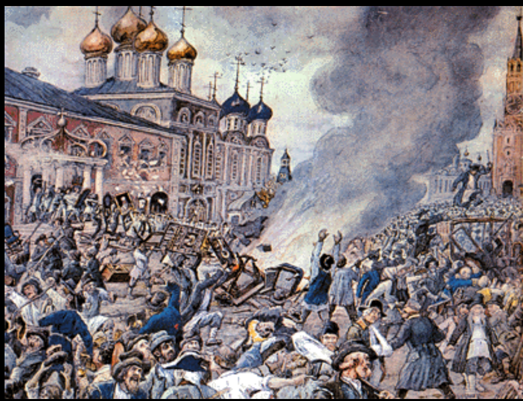
The Bubonic Plague – 14<sup>th</sup> Century